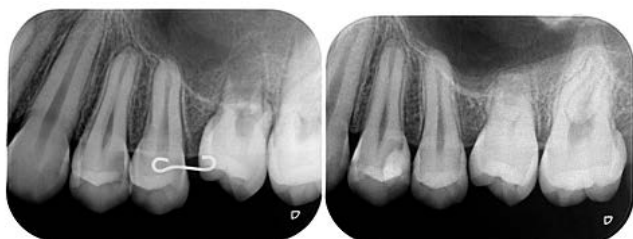
Figure 7. Male, 14 years old. The donor tooth germ (#28) was transplanted in the #26 site.

Left: Immediately after surgery. Right: Seven years after surgery.