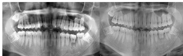
Figure 9. Male, 15 years old. The donor tooth germ (#28) was transplanted in the #36 site.

Left: Immediately after surgery. Right: Five years after surgery.