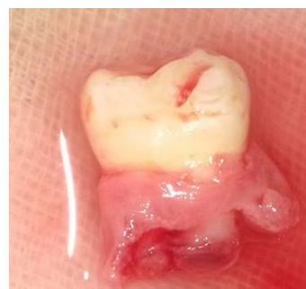
Figure 3. The tooth germ of #48 was extracted with the dental follicle in the cervical region.

tooth (#46) for 1 month, with adjustments made to remove occlusal force from the tooth (Figures 3-5).