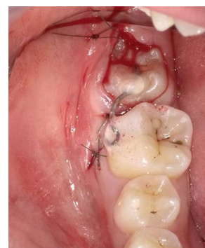
Figure 5. Dental X-ray findings. Left: Immediately after surgery. Right: Three years after surgery.

An Electric Pulp Test (EPT) (SybronEndo, Yoshida Co., Tokyo, Japan) was done after removal of tooth fixation. From the period of fixed removal to 5 years after the surgical procedure EPT test results were consistently negative. No root canal treatment was performed, as the pulp cavity showed shape changes in dental X ray examinations. At 3 years after the operation, no periodontal problems were observed, while the transplanted tooth was found to have migrated in a mesial and occlusal plane direction, with contact between adjacent teeth and occlusal contact with the opposite tooth observed. EPT findings remained negative, though the transplanted tooth showed good function. According to the past report, the success criteria after treatment are no clinical signs and symptoms of infection and inflammation around the donor teeth, no pain and no sensitivity to percussion, no root resorption and no ankylosis on X-ray examination was observed [7]. On the basis of success criteria, this case was in good success.