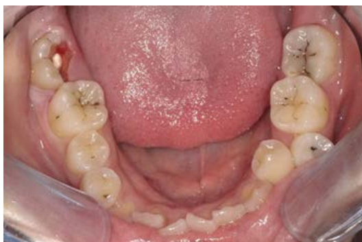
Figure 1. Occlusal view, first medical examination. The right second molar (#47) showed severe decay.

Clinic in 2013. An extra-oral examination showed no facial swelling or palpable lymph nodes. Intra-oral examination findings revealed no sinus tract and no periodontal pocket, while the clinical crown of tooth #47 was severely destroyed to the under subgingival level. The prognosis of the affected tooth was considered to be hopeless due to severe damage to the coronal tooth structure (Figure 1). Radiographic imaging revealed unsatisfactory previous endodontic treatment, along with a periapical lesion and broken lamina dura. The diagnosis was a combined periodontal and endodontic lesion. Panoramic X-ray results showed a premature mandibular right third molar with half of the root in a development stage, according to Moorrees' classification, and completely impacted, thus it was considered to be a proper candidate for auto-transplantation (Figure 2).