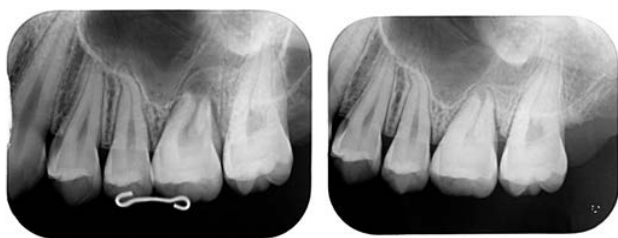
Figure 8. Female, 19 years old. The donor tooth germ (#28) was transplanted in the #26 site.

Left: Immediately after surgery. Right: Three years after surgery.