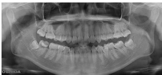
Figure 2. Panoramic X-ray findings. The immature tooth germ of #48 was shown next to #47.

A complete explanation of the procedure, as well as its risks and benefits were presented to the patient and necessary permission was obtained. A 0.05% chlorhexidine gluconate solution was used for oral disinfection. Oral surgery was performed under local anesthesia, with an inferior alveolar nerve block used for tooth #47 with 2% lidocaine and 1:80000 epinephrine (Dentsply, Japan). The mandibular right second molar was extracted in an atraumatic manner without any bone removal. Extraction was performed with a straight elevator and the socket was prepared by sterile saline irrigation. A triangular flap design provided excellent access to the surgical site. Tooth #48 was extracted without trauma and a minimum amount of distal bone removed. The extracted donor tooth was kept in sterile wet gauze for less than 15 minutes, then placed into the recipient socket. After transplanting the donor tooth, it was splinted with rectangular wire and resin cement (Super-Bond, Sun Medical, Japan) with the adjacent